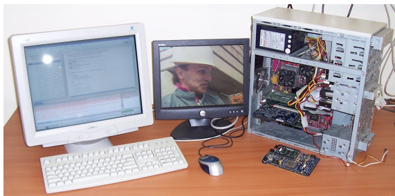
Figure 2. Photograph of our wavelet-based scalable video decoder in action.